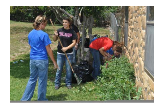
Blinn Blitz 2012 Huge Success Thank you to all!